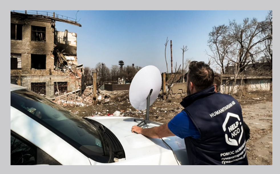
KHARKIV, JULY 2022. Help.ngo operations team provided Starlink terminals to enable un Agencies operating in Eastern Ukraine

Help.NGO procured 25 Starlink terminals to ensure high bandwidth connectivity in humanitarian hubs in Odesa, Kharkiv, Dnipro, Vinnytsia, Kyiv, Rzeszow, and Krakow. The terminals continue to provide high-speed and reliable connectivity to UN personnel deployed on a permanent or temporary basis to the humanitarian mission to Ukraine.